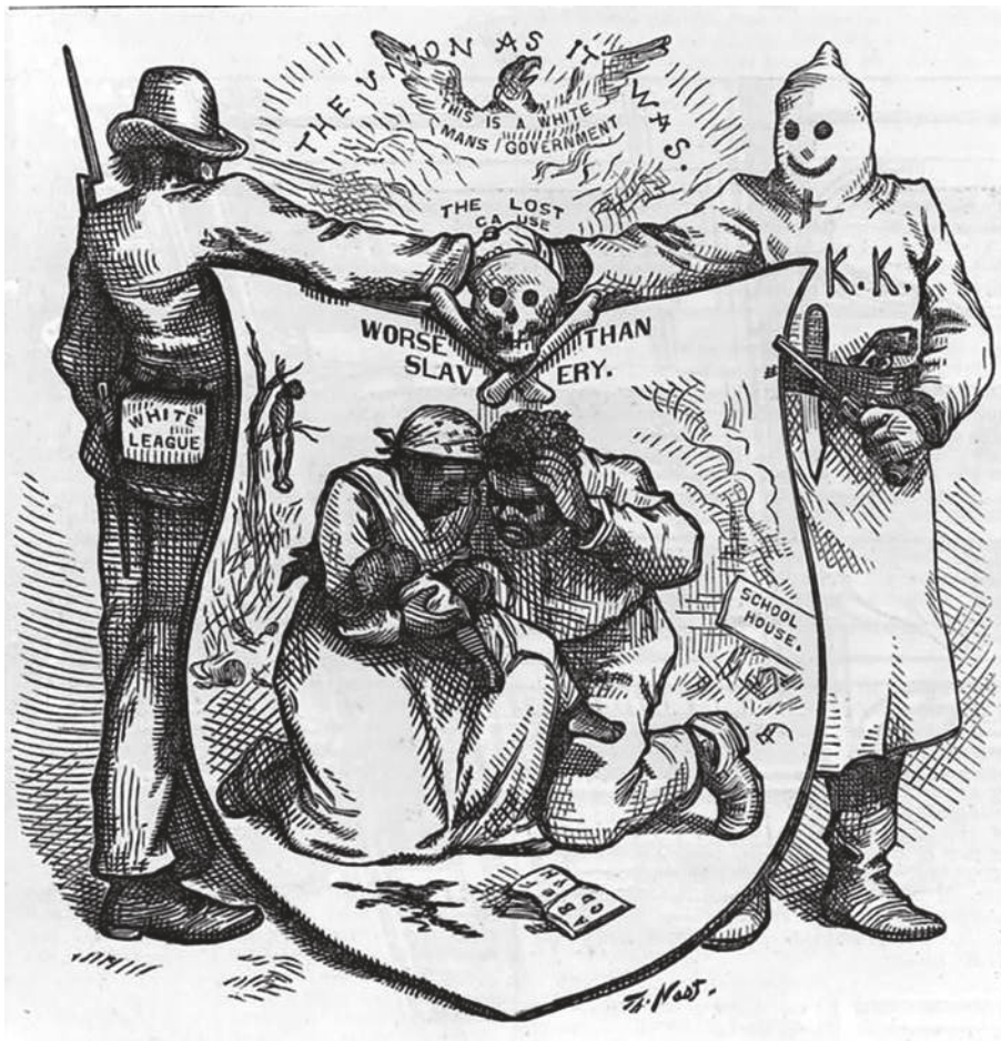
A cartoon published in an American magazine, October 1874.